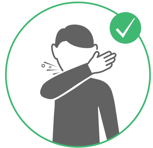
covering mouth with elbow

REMEMBER! Always wash your hands after you cough, sneeze, or blow your nose so you don't spread germs!