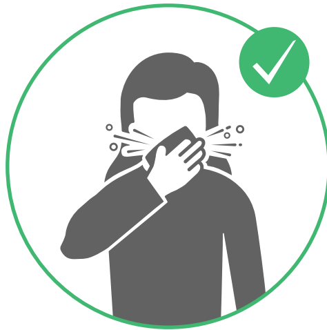
covering mouth with tissue