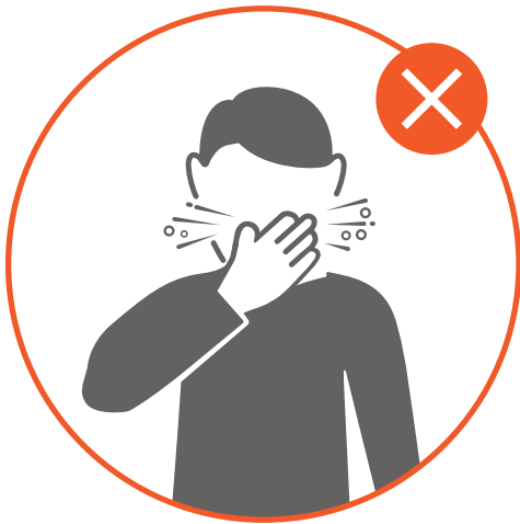
covering mouth with hands